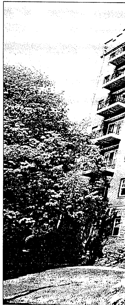
The buildings stand tall and solid. The arched entryways mark the era. The ap-

"Management is fantastic," she continued. "Maintenance is very good. We've had no problems at all, and it's getting even better as they're remodeling everything, like the halls and lobbies, and the apart-